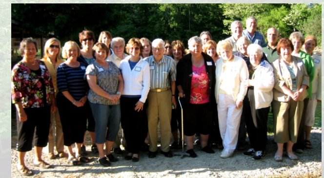
Volunteer appreciation picnic 2011

This Program continues to help incompetent, indigent adults in Medina County. Currently there are 39 trained volunteer guardians and 25 wards actively being served. A total of 50 indigent wards have been served by volunteer guardians since the inception of the program in 2004.