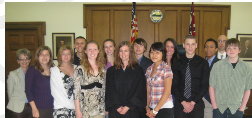
Teen Court Participants

Teen Court is an intervention program that offers first-time misdemeanor-offending youth the opportunity to be heard by a jury of their peers. Under the supervision of the Court, local teens serve as attorneys, jury members and bailiffs. In 2011, 14 youth participated in Teen Court.