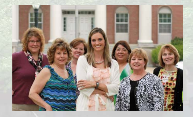
Volunteer Guardianship Program Advisory Board

Probate Court assesses and collects court costs in a manner similar to the Clerk of the Court of Common Pleas. Court costs are assessed in all probate cases, which include estates, guardianships, adoptions and trusts. Costs collected by the Court are distributed to state, county, and local governments. In 2011, the Probate Court collected over $266,000.