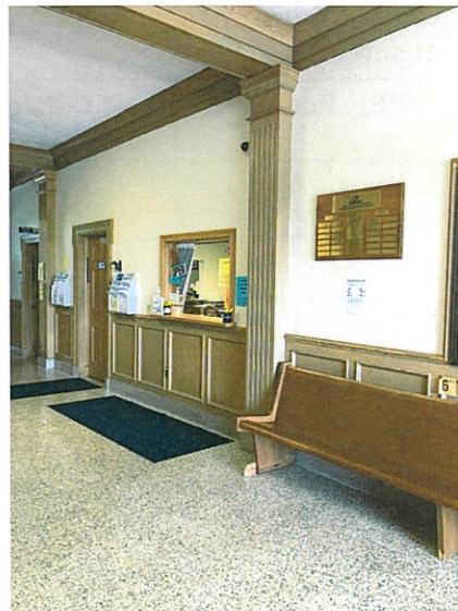
Probate Court had a window installed in the clerks' area by Medina County Maintenance as a means of practicing social distancing.

In May, the Medina County Juvenile and Probate Court was awarded a technology grant by the Supreme Court of Ohio to help fund the purchase of necessary technology to conduct hearings remotely and