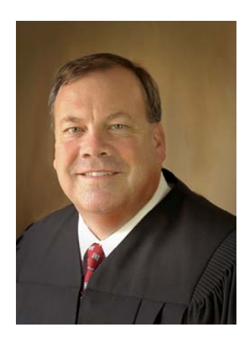
JUDGE KEVIN W. DUNN MEDINA COUNTY PROBATE COURT JUDGE

10825 East Boulevard, Cleveland, Ohio 44106