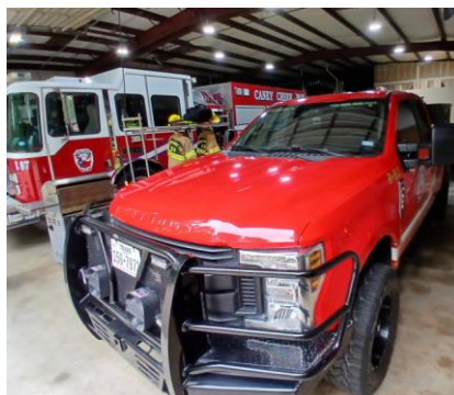
Grass truck and Engine 83

Caney Creek Fire and Rescue is already making a meaningful impact in the community—and they're just getting started.