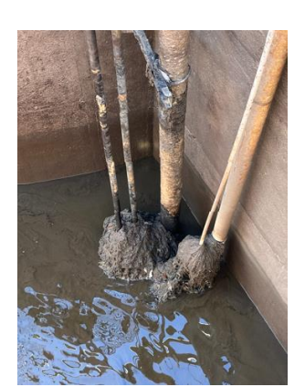
Flushables in sewer plant