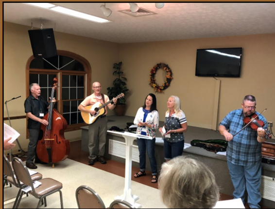
Wonderful times of worship