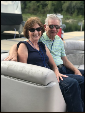
Pontoon boat rides

ATTN: Pastors and Wives “FREE “ WEEKEND GETAWAY!