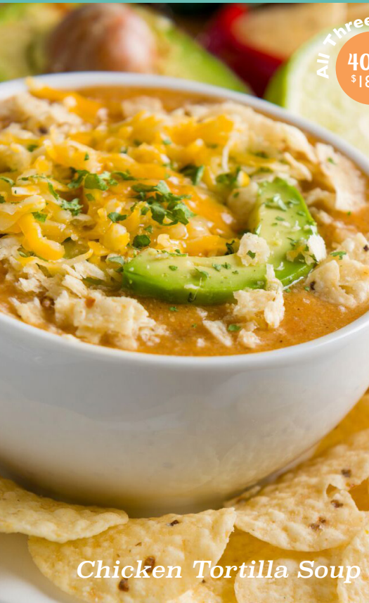
Chicken Tortilla Soup