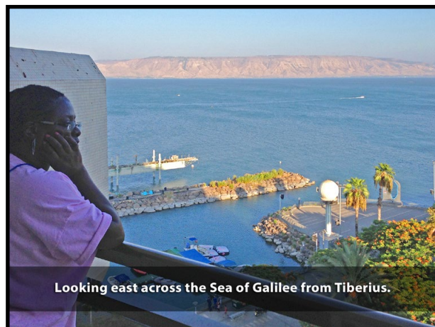
Looking east across the Sea of Galilee from Tiberius.