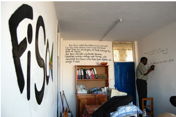
The old FISCH office

- Pray for the site for the old FISCH office. There is currently 6 months left on the contract. Pray that the contract can be terminated early or God will provide someone to take it.