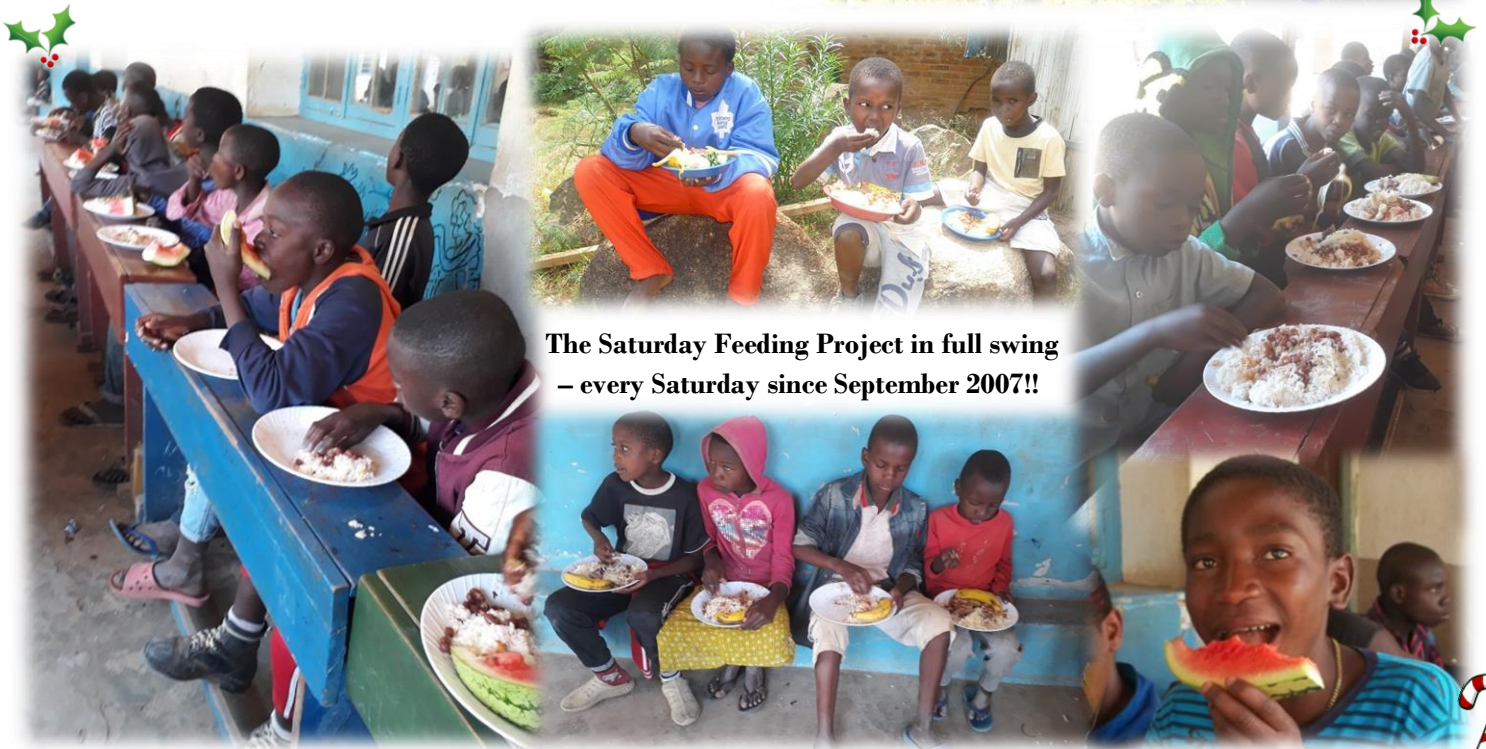
The Saturday Feeding Project in full swing – every Saturday since September 2007!!

For to us; a child is born, to us; a son is given... and He will be called Wonderful Counsellor, Mighty God, Everlasting Father, Prince of Peace. Isaiah 9:6