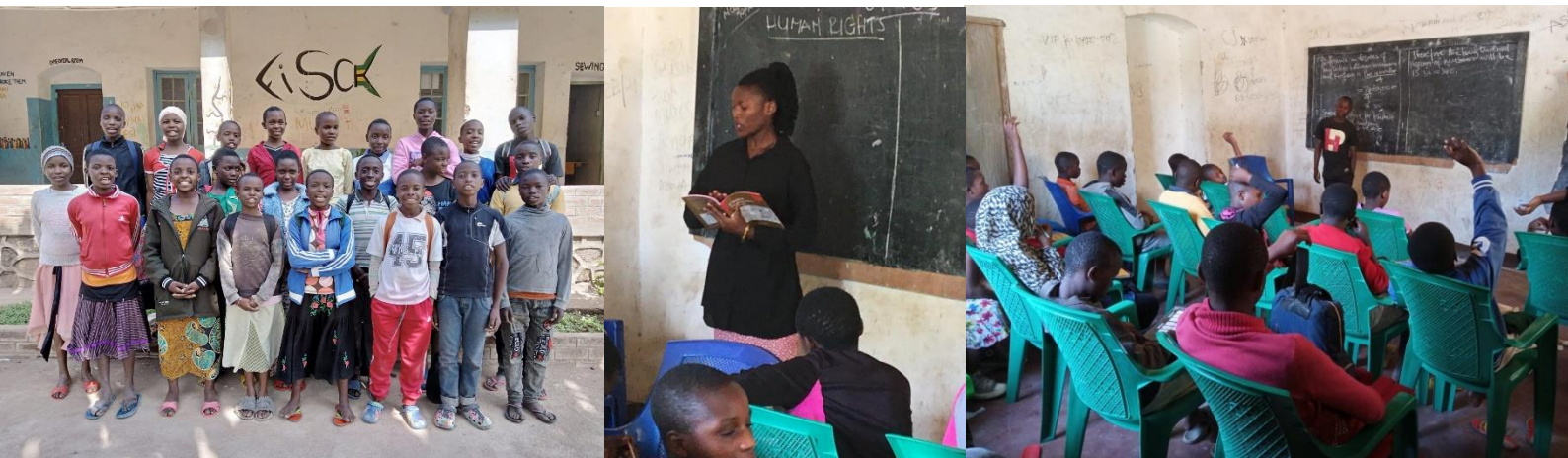
Left – The students from the Learning Centre Middle – Promina teaching Right – class is in session!