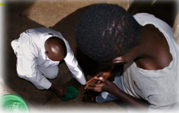
☞ Palm Sunday celebrations