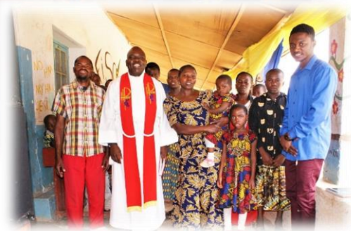
FISCH Church Easter Sunday celebrations ☞