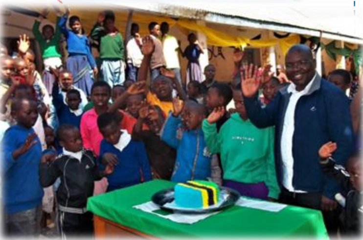
Top left: the celebrations included dance Middle left: the cake! Bottom left: everyone celebrating together Right: everyone shares a meal

What a wonderful achievement it is to reach 15 years in action. Of course, the ultimate thanks must go to Father God and His never-ending grace and mercies. FISCH was founded to witness the love of Christ to the Street Children of Iringa, and we are so grateful and honoured to be part of this Project with Him. Praise Him!