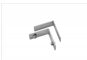
Lockset hanging profile