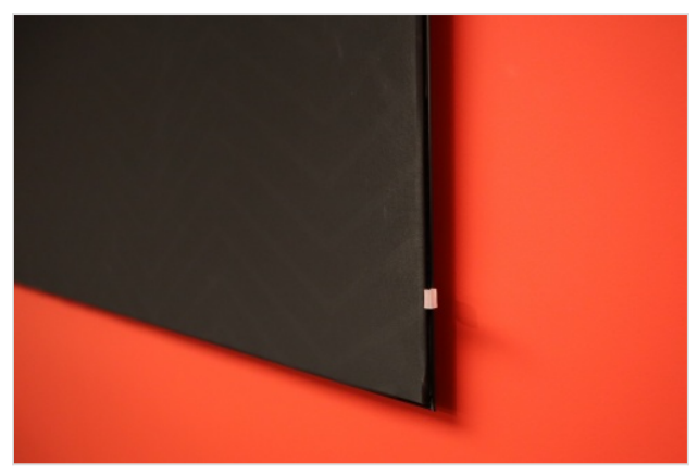
Heavy 26 45° Single-sided textile frame