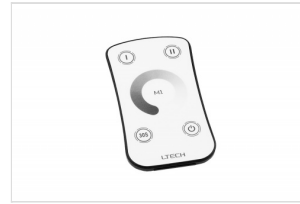
Dimmer remote AF92-230