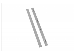
Extension set Eco/Simple