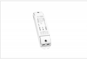
LED controller dimmer AF92-220