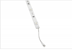
FK2-C 12LEDs AF92-420