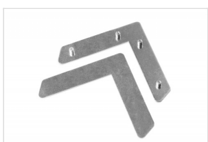
Lockset heavy FK-0200