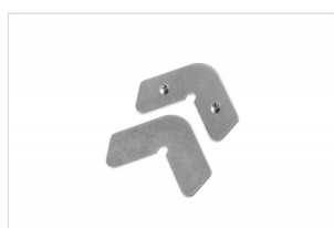
Lockset heavy short FK-0205