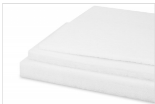
Therm Acoustic FK-8930