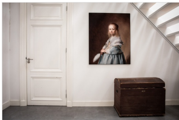
Single 50 Single-sided textile frame