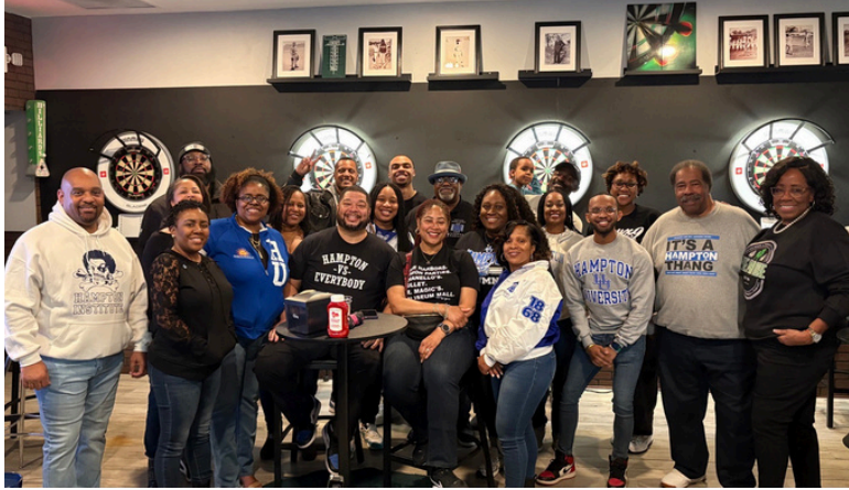
Group Picture from Center Pocket, March 4 th Friday event!

PG Pirates! As we spring into the season, we're excited to bring you a lineup of fun activities, meaningful events and opportunities to connect.