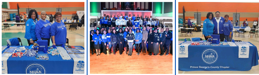
Pictures from HBCU Fest at Westlake High School and the Hampton University Concert Choir February 2026.

PG Pirates! We're excited for a year full of recruitment events, networking opportunities, and impactful fundraising efforts. We encourage you to pay your dues and get active with the chapter!