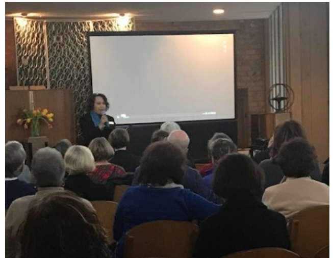
Pictured below are Soroptimist International of Grosse Pointe Members and Grosse Pointe Unitarian Church Committee

Soroptimist International of Grosse Pointe partnered with the Grosse Pointe Unitarian Church for a free presentation of the documentary “Stuck in Traffic” on Sunday, February 24th. The film is a raw and realistic exploration of the human trafficking epidemic in Michigan. The event also included discussion with local experts and advocates in the field. Further, literature was provided that offered information on safe and effective ways to support anti-trafficking initiatives. Over 65 people attended the event and many commented to SIGP members that the experience provided new insight into an issue they were unaware was so close home. Overall, this presentation model was a success and it is the hope of SIGP to do similar events with other partnering organizations in the future.