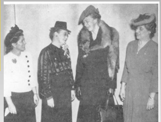
US First Lady Eleanor Roosevelt is the honored guest and speaker at a weekly luncheon of the Washington DC Club in 1943