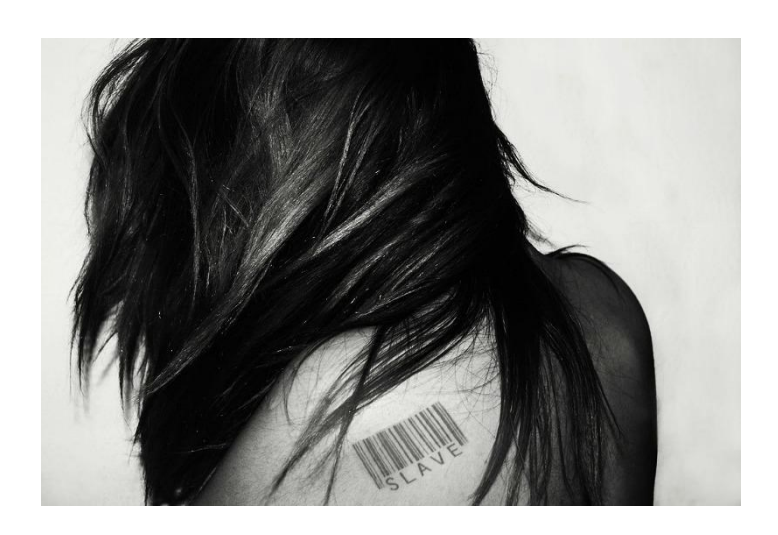
Let's eradicate human trafficking in all its forms this month and every month!

Our Soroptimist International of Dayton club will continue transforming anti-trafficking work efforts through our Missing Children Poster and STOP restroom label programs. Working with our collaborative partners, we seek to end commercial sexual exploitation through advocacy, awareness, legislation, policy, and action.