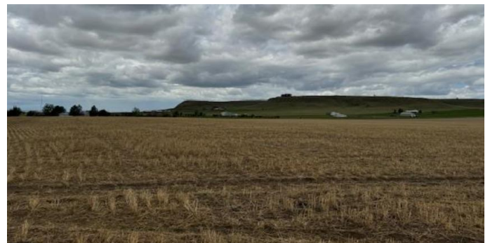
Montana Regional Healing Center Site – Land Survey in Process Contracted with Ries & Associates.

Getting a new treatment facility up and running is an ongoing process that involves several important steps. First, planning and securing necessary permits must be completed to meet all legal and environmental standards. Throughout this process, testing and inspections help verify that everything operates smoothly and safely. Next comes a complete Land Survey which are contracted and currently in progress . Staffing is important throughout the process, ensuring that qualified professionals are hired and trained to provide top-quality care. Collaboration among engineers and healthcare experts are key factors, as well as the annual operating budget. While it may take time, each phase creates a fully functional, efficient treatment facility ready to serve its community. Before continued expansion or significant funding commitments, FBIC will ensure, sovereignty is protected, governance authority is balanced, and legal exposure is clearly defined and controlled.