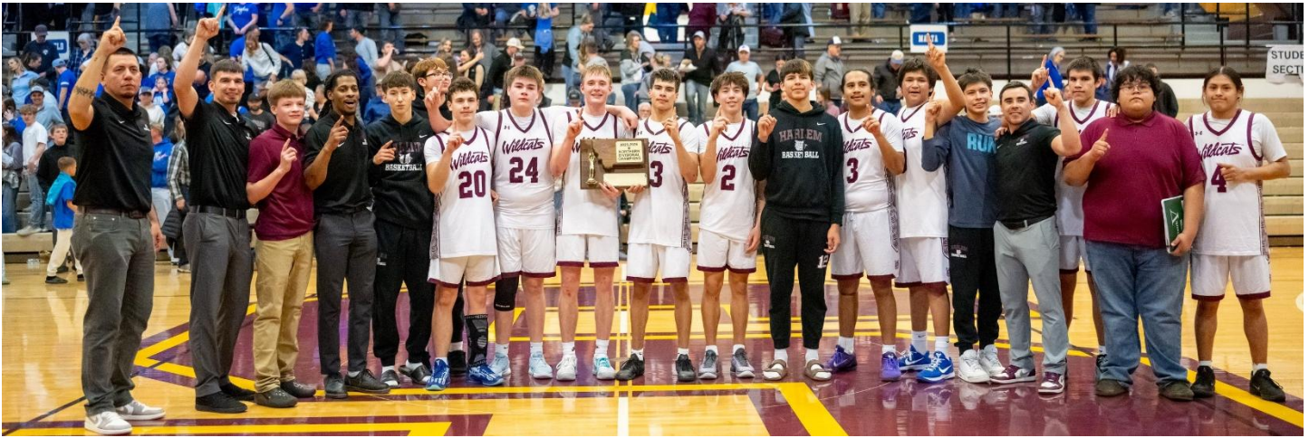
Northern B Divisional Tournament in Shelby, MT