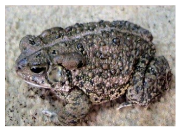
Photos: Woodhouses Toad, Great Plains Toad, Northern Leopard Frog, and Boreal Chorus Frog.

Amphibians have the Adaptive Capacity to quickly develop through their life stages, because of the short growing season that our climate gives us. Some years when water is in short supply and the ponds begin drying, before the amphibian's reach maturity, we can lend a helping hand...literally, by moving the egg masses from one pond, to another pond that has deeper water, thus ensuring the survival of the species.