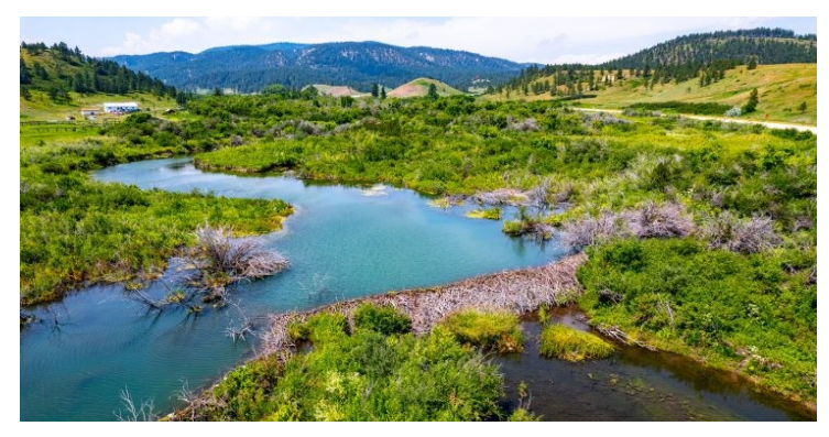
Beaver Creek Beaver Dams-Little Rocky Mountains. (Longknife Ranch in the background)