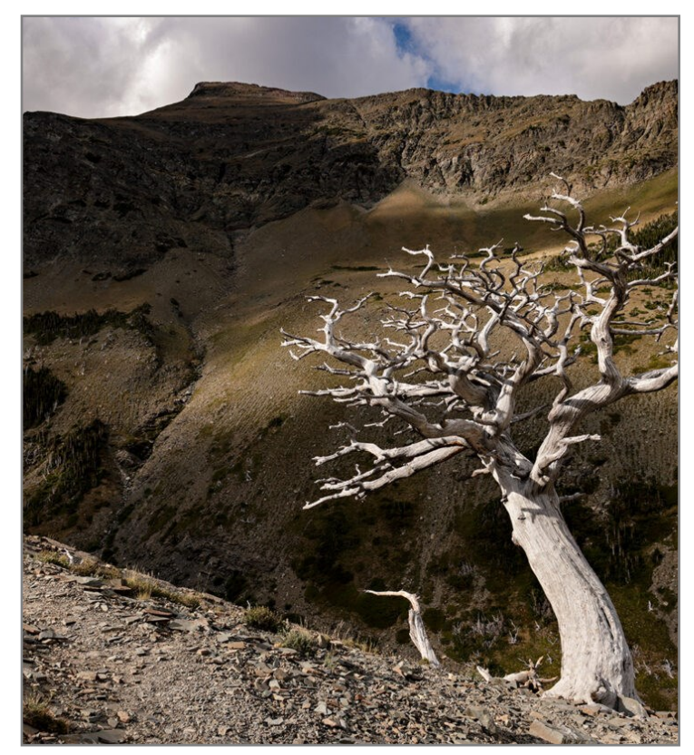
A dead whitebark pine in the Two Medicine area of Glacier National Park on July 28, 2023.

One section of the StoryMap focuses on the CSKT's whitebark pine tree restoration efforts. The whitebark pine is considered a keystone species in the alpine landscape and holds in important place in tribal heritage.