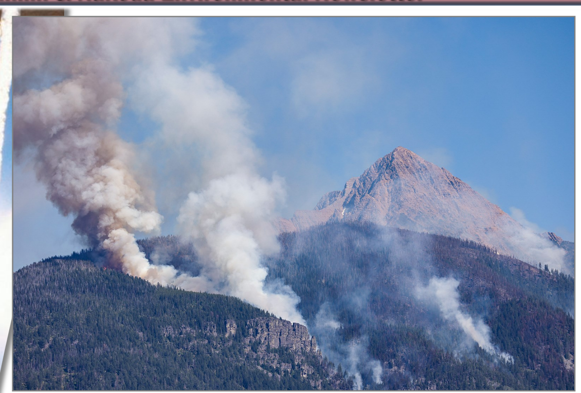
Smoke from the Redhorn Fire shrouds the craggy summits of the Mission Mountains as viewed from near St. Ignatius August 7, 2022.