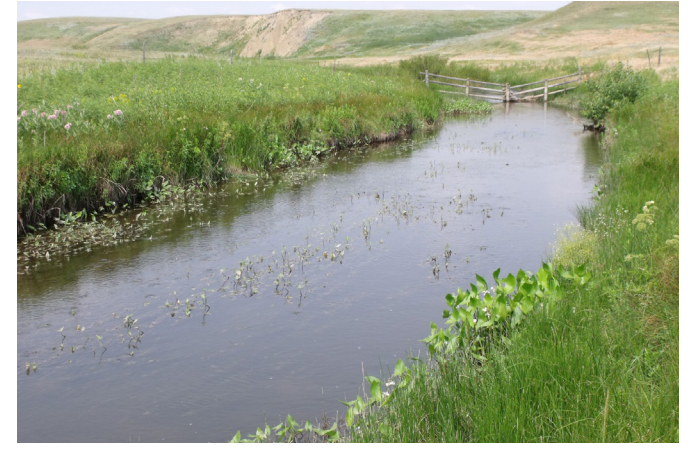
Figure 6. Peoples Creek is a perennial stream that drains north to the Milk River.

On heavily infested sites, cultural control techniques may include sheep grazing and revegetation on areas with inadequate native plants. If sheep are grazed at sufficient and proper intensity and at the right time, they can deplete the root density of Canada thistle and leafy spurge, diminishing the ability of the infestation to withstand the effects of herbicides. For leafy spurge, a grazing program that includes a minimum of two grazing periods in a season, each followed by a rest period, is more effective than season-long grazing.