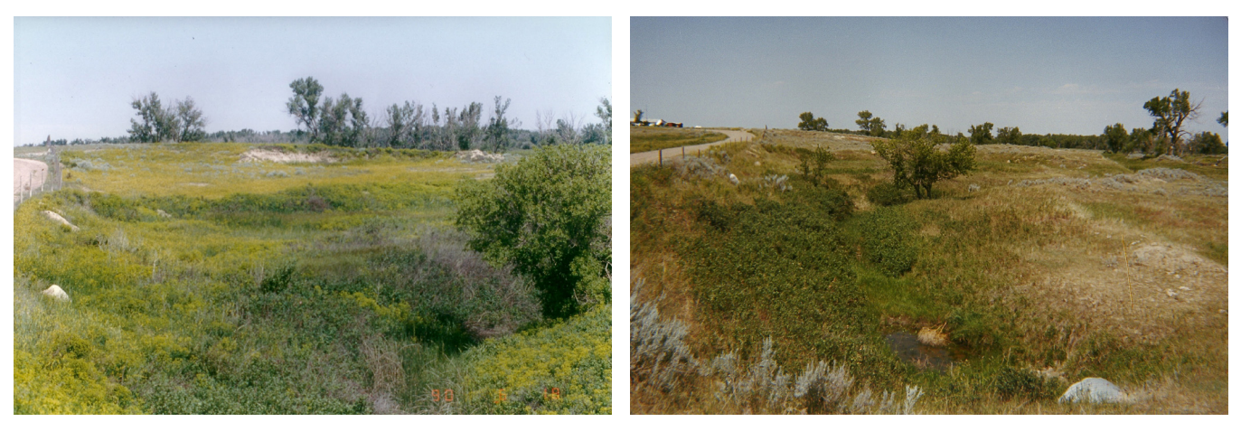
Figure 8. Leafy spurge infested site near Route 8 (left). The same site several years after the release of Aphthona flea beetles (right).

and plants are frequently observed growing in hay fields. Producers may be transporting seeds with hay shipments to many sites on and off the reservation.