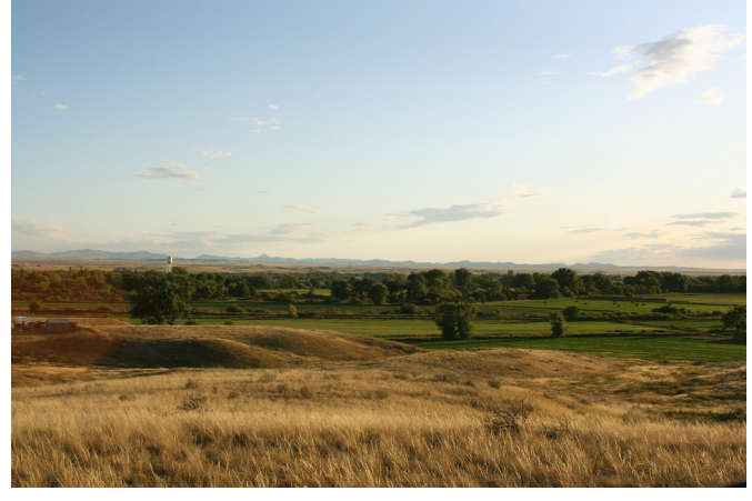
Figure 2. The Milk River Valley is located in the northern part of the reservation.

Most of the reservation (approximately 76 percent) consists of flat land or gentle rolling hills of the Glaciated Plains (Figure 4), which is best suited for raising livestock. The dominant vegetation is northern mixed grass prairie, commonly represented by western wheatgrass ( Pascopyrum smithii ), blue grama ( Bouteloua gracilis ), and needle and thread ( Hesperostipa comata ). Dominant forbs include scarlet globemallow ( Sphaeralcea coccinea ), wooly plantain ( Plantago patagonica ), and American vetch ( Vicia americana ). Dominant shrubs include silver