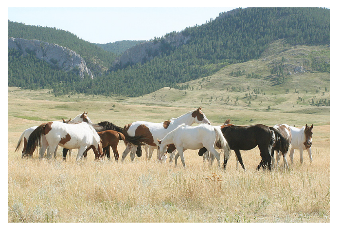
Figure 3. A herd of horses on the north side of the Little Rocky Mountains near Lodge Pole.