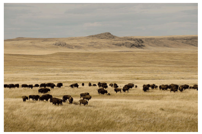
Figure 4. The Glaciated Plains were formed from sediment deposited beneath a moving glacier, which left behind a gently rolling landscape.