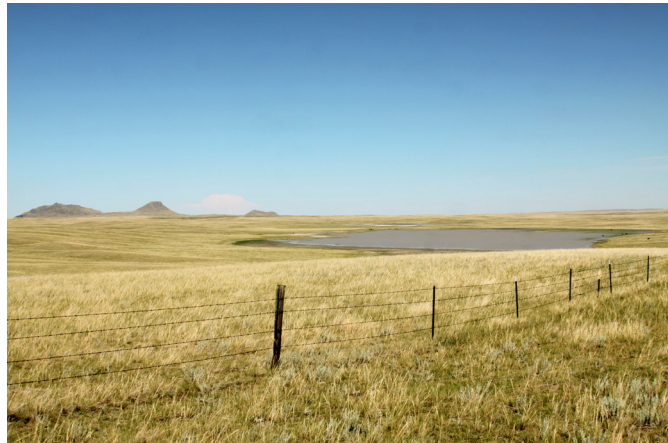
Figure 5. Lake 17 with Three Buttes in the background.