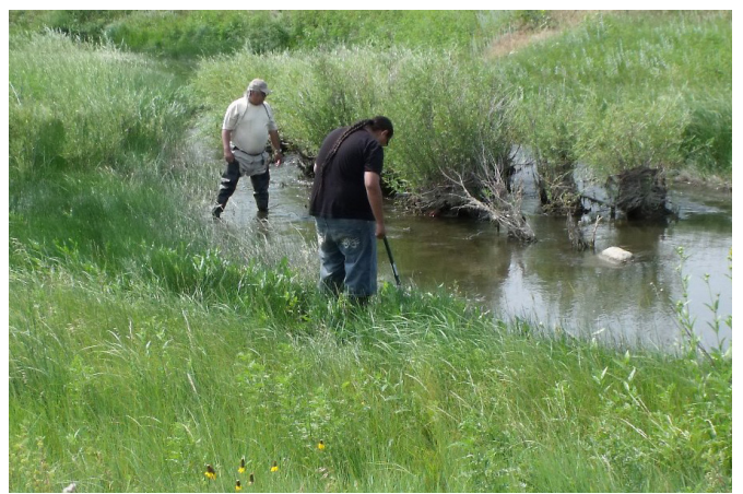
Figure 7. Tribal members collecting data to assess the stream habitat of Peoples Creek.