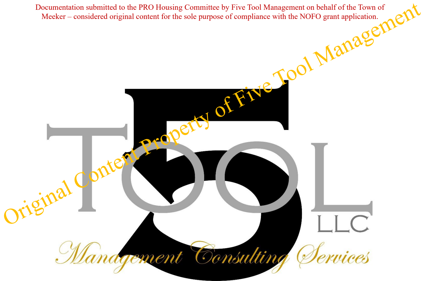
Exhibit B Threshold Requirements and Other Submission Requirements

Documentation submitted to the PRO Housing Committee by Five Tool Management on behalf of the Town of Meeker – considered original content for the sole purpose of compliance with the NOFO grant application.