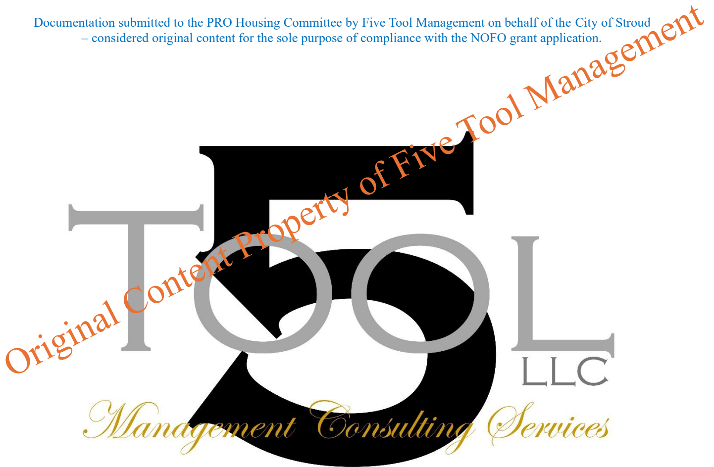
Exhibit E Capacity

Documentation submitted to the PRO Housing Committee by Five Tool Management on behalf of the City of Stroud – considered original content for the sole purpose of compliance with the NOFO grant application.