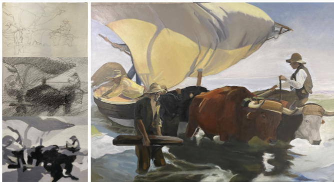
JOAQUIN SOROLLA MASTER STUDY

Die Künstler von Fredericksburg will meet on Thursday, May 5, at 6:30. Doors open at 6 pm, giving those in attendance time to look through the many DVD's available for members to check out. Members may check out up to 3 DVDs. We meet at the Historical Society at 312 W San Antonio Street. Follow the sidewalk to the side entrance. The meetings are free, and all are welcome.