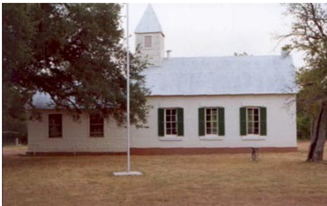
This country schoolhouse was built in 1901. Schoolchildren attended until 1960.

Our next plein air event will be at Lower South Grape Creek School 10273 East Hwy 290 10 am – noon Saturday, September 17