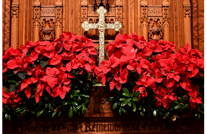
DISPLAY OF POINSETTIAS AT ST. JOHN'S EPISCOPAL (FL)

One of the best-known customs for the season is the Advent wreath. The wreath and winter candle-lighting amid growing darkness strengthen some of the Advent images found in the Bible. The unbroken circle of greens is clearly an image of ever-lasting life, a victory wreath, the crown of Christ, or the wheel of time itself.