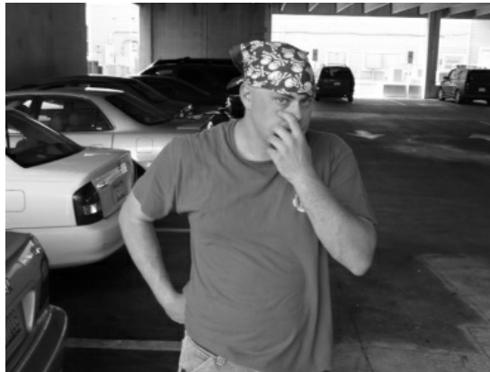
What's in his right hand?

their waist line. It may be in a back pocket, under the waist band, front pocket, etc., but often it will be near the center of gravity. Hands moving in that vicinity therefore are also good pre-fight clues and indicative of the fact he may have a weapon concealed in that area. Be especially wary of anyone who's hand or hands you can't see. Bodyguards are trained to scan constantly between hands and eyes because eyes will conceal the intent and the hands will conceal the weapon. If someone is getting within range with at least one hand out of sight tell them to show it to you or get ready to escape or deal with a weapon attack.