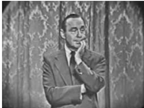
Jack Benny's classic stance

up your hands and keep them between you and your antagonist. There are many ways to accomplish the hands up pose. Some people fold their arms (if you do this don't have the arms intertwined), some put their hands up, palms facing the aggressor, some place only one hand up like a police officer telling a driver to stop, some point at the person while others do what is called a "Jack Benny" (named after a popular talk show host who used to stand this way when talking to guests) with one arm folded across the chest and the other on the chin like Rodin's statue.