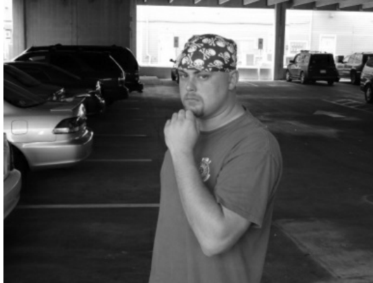
Body now "bladed" and right hand loaded to launch

The above four are by no means exhaustive, but are the best four to rely on. Other instructors talk about the face becoming pale (blood draining from the extremities to fuel the major muscle groups as mentioned in the section on adrenalin), shallow rapid breathing, thousand yard stares and so on. The problem with all of those is they can be easily misinterpreted. If a person for example is arguing with you after a near miss in traffic, adrenalin may cause the pale face and shallow rapid breathing despite the fact the person has no intention of assaulting you. The main four however are very rarely confused for anything else but what they are, pre-fight indicators.