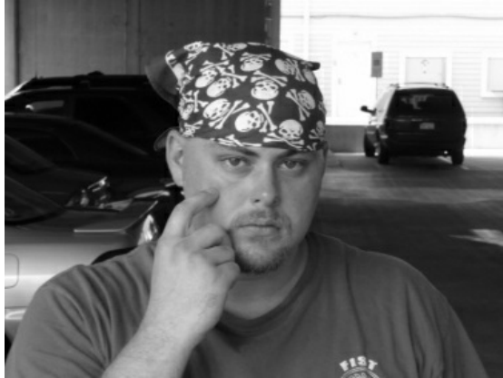
Classic grooming indicating deception