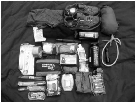
My Bug in Bag Contents

A Bug in Bag is a small backpack, or equivalent, packed with some simple items that will help you get home (Bug In) in the event of a breakdown, blackout, or similar emergency. The Bug Out Bag is similar in content except it is usually bigger and contains elements to camp out and survive in the wilderness should it ever become necessary to leave home and head for hills.