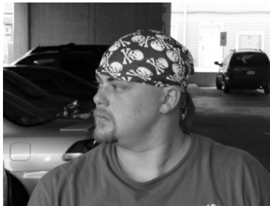
Furtive glancing looking for witnesses, cameras, cops, and escape routes

For law enforcement the glance is a giveaway that the suspect is about to run. In that instance he is looking for escape avenues. For targeted civilians the glance will precede the attack and is being used by the bad guy to ensure there are no witnesses, cameras, or law enforcement around. It will typically be furtive and fast and may be repeated more than once as he continually scans the area. Sometimes, the bad guys will look at a target right before they launch their attack, which is especially prevalent in law enforcement when attempts are made to grab for an officer's gun.