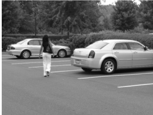
Victim has isolated herself

walk into their trap, or they may follow the victim from the mall to the parking lot. They don't have to spook the herd like their animal counterparts because typically the victim will isolate him or herself.