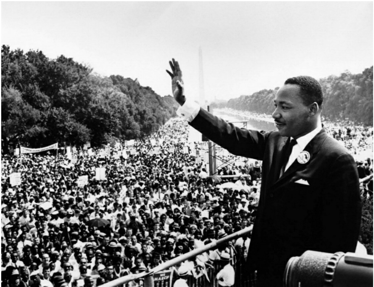
Martin Luther King Jr.

Of course, neither America nor any other nation has perfectly lived up to the universal truths of equality, liberty, justice, and government by consent. But no nation before America ever dared state those truths as the formal basis for its politics, and none has strived harder, or done more, to achieve them.