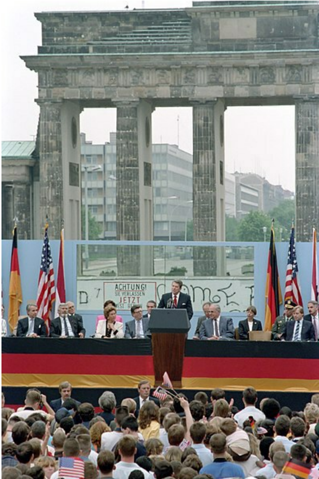
Ronald Reagan speaking at the Brandenburg Gate