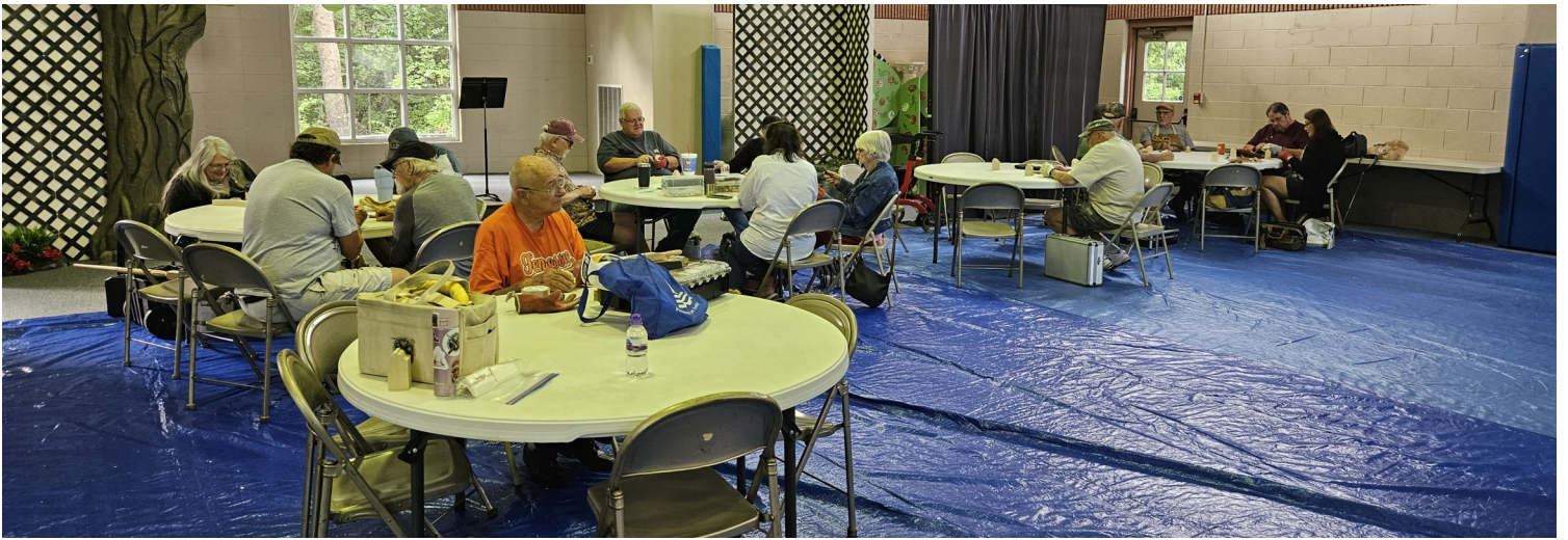
Wide-angle shot of the carving tables. Not shown, but off to the left, is the table with three wives and to the right is the “Stammstich” table. Behind is the table display with all the carvings.