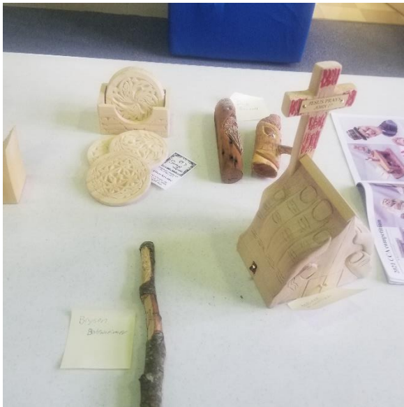
Ellen did the chip carved coasters; Bruce Koopika the church