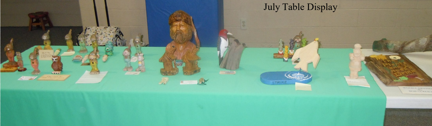
July Table Display