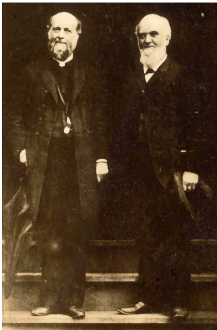
Founders of what is now the Chautauqua Institution: Inventor Lewis Miller and Methodist Bishop John Heyl Vincent.