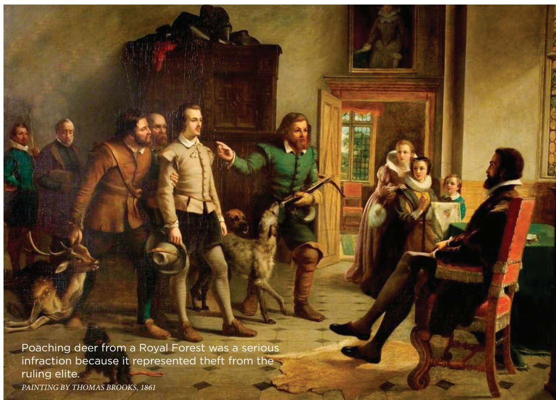
Poaching deer from a Royal Forest was a serious infraction because it represented theft from the ruling elite.

Because of the high value of venison, it became a way to