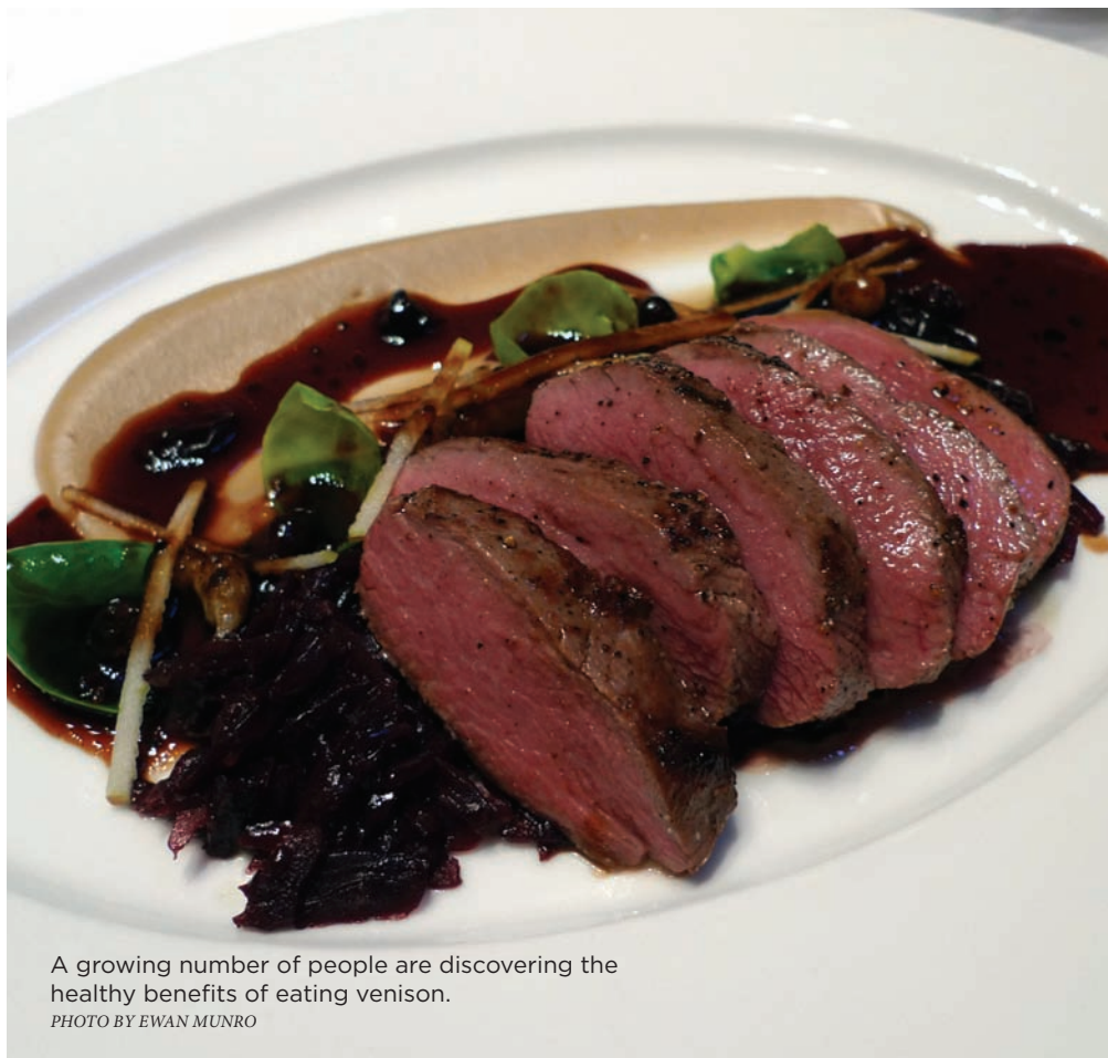
A growing number of people are discovering the healthy benefits of eating venison.

It is not surprising that venison is so sought-after. Of all the meats we eat, venison in particular is increasing in popularity because of the trend toward a healthier diet, lower in saturated fats and without a lot of preservatives and artificial growth additives.