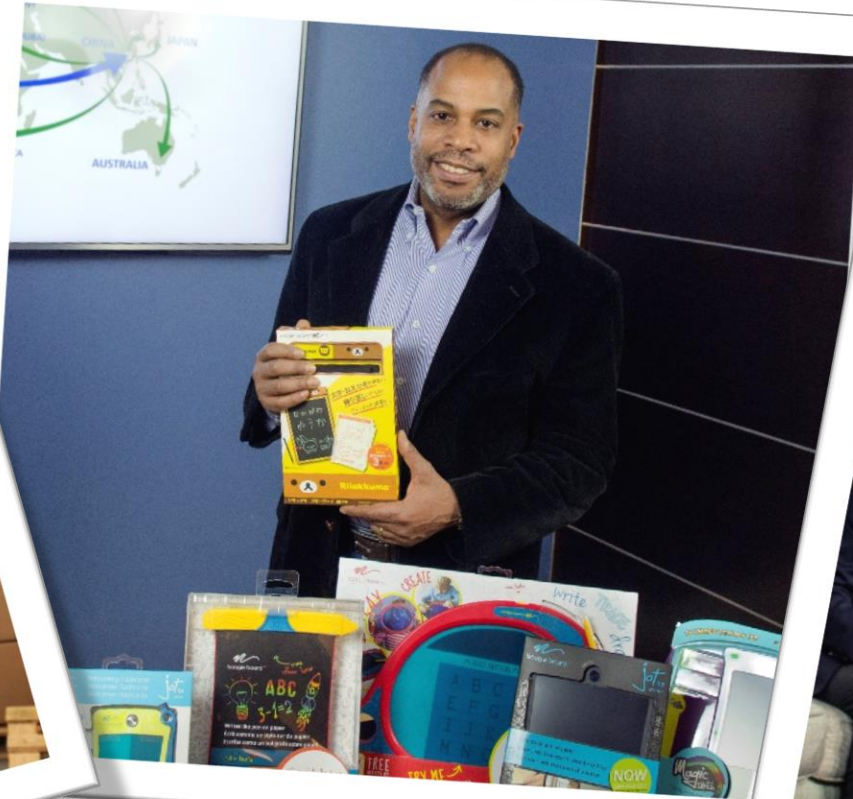
International Business News Magazine Cover