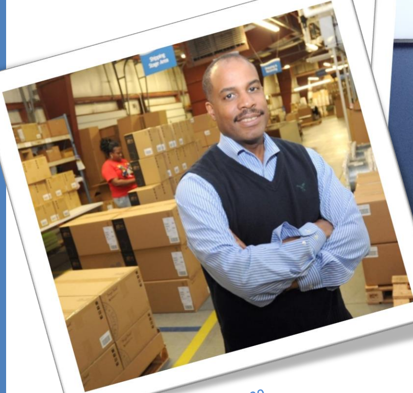
Kent Displays Warehouse