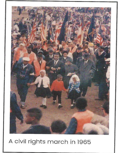
A civil rights march in 1965