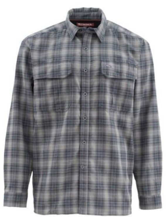
10. Simms Coldweather Shirt and Simms Telluride Angler Logo hat

While Telluride is not the coldest place to fly fish (we wouldn't try to rob you of that, Montana), it does sit at 8,750' in the San Juan Mountains of Southwest Colorado. The Simms Coldweather Shirt is a heavy flannel of 100% brushed polyester for a cotton-like feel without the impossible dry time. It is lined with micro check fleece that is toasty, cozy and ready for a stout beer, a pickup truck and some chainsaw work.