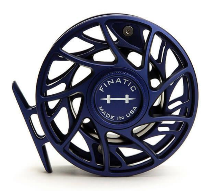
[Shop Hatch Limited Edition Colors]