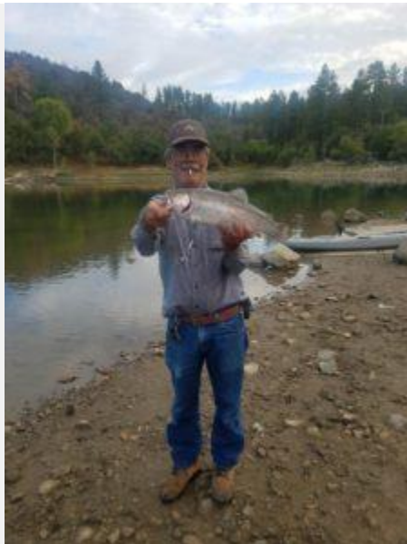
Goldwater Lake (from July, 2018)

Frances Short is a great place to take young anglers to catch lots of crappie, bluegill and catfish during the summer. A small piece of worm fished under a bobber will catch the crappie and sunfish while hot dogs work for the catfish.