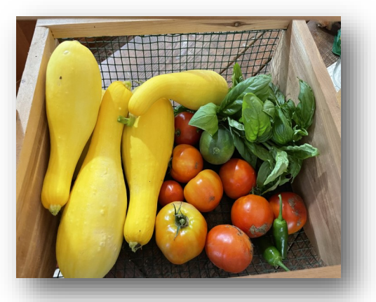
Yummy and such a joy to grow and eat!!