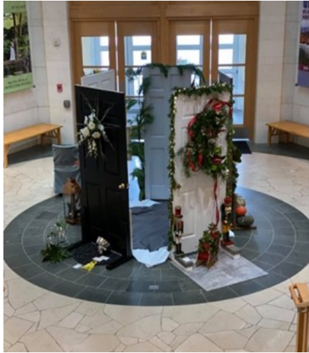
Club Competition Award