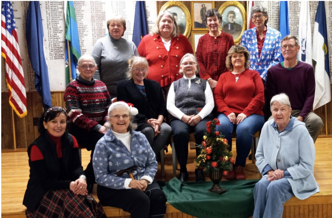
We ended 2022 with a delightful Christmas luncheon at the American Legion.