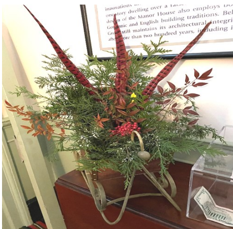
These two pictures are from Belle Grove