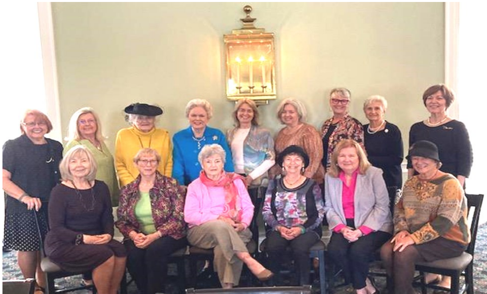
Group picture of members and guests of the Natural Bridge Garden Club