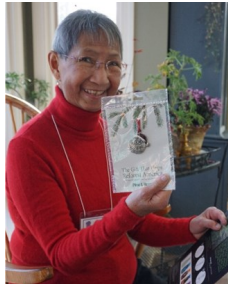
Suiling's gift will help reforest America! Wow!