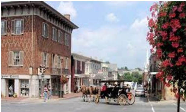
Lexington's Main Street. (Note: the hanging basket of geraniums is one of many the local County Council of Garden Clubs provides each year to enhance the downtown center).