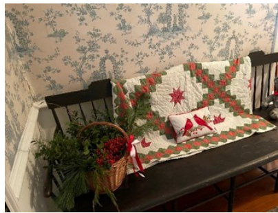
These four pictures are Abrams Delight