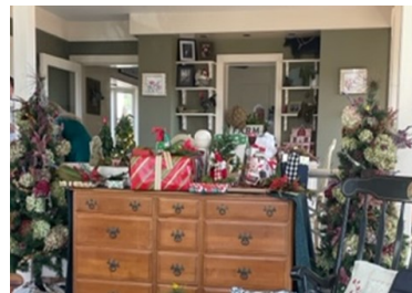
Stack of gifts waiting to be chosen!