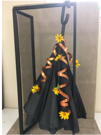
Left: April Showers Lower Left: Summer Time Lower Middle: Winter "snowing" Lower Right: Tornado