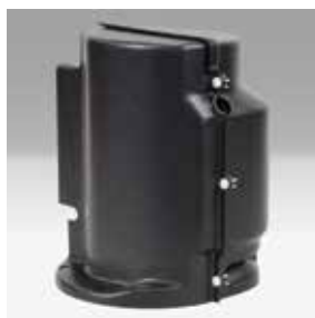
Optional sound cover further reduces compressor noise by up to 50%.