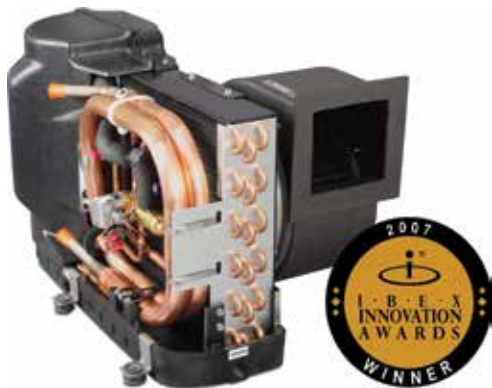
Turbo air conditioner shown with optional sound cover

Powerful, Quiet & Compact With No Drain Pan Worries