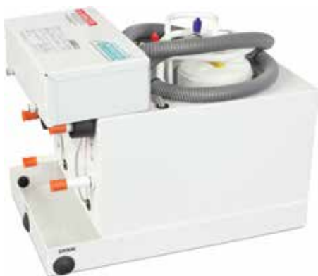
CHCG20Z shown with the electrical box mounted to the top (standard).

Marine Air's Chiller Compact series is ideal for larger boats in the 45-70 ft. (15-20 m) range. Available in capacities of 16,000 and 20,000 BTU/hr, the Chiller Compact uses circulated water in a closed loop in place of copper refrigerant tubes. The innovative, space-saving compact base of the Chiller Compact was designed to allow individual modules to be multiplexed to provide precise capacity requirements for any application.