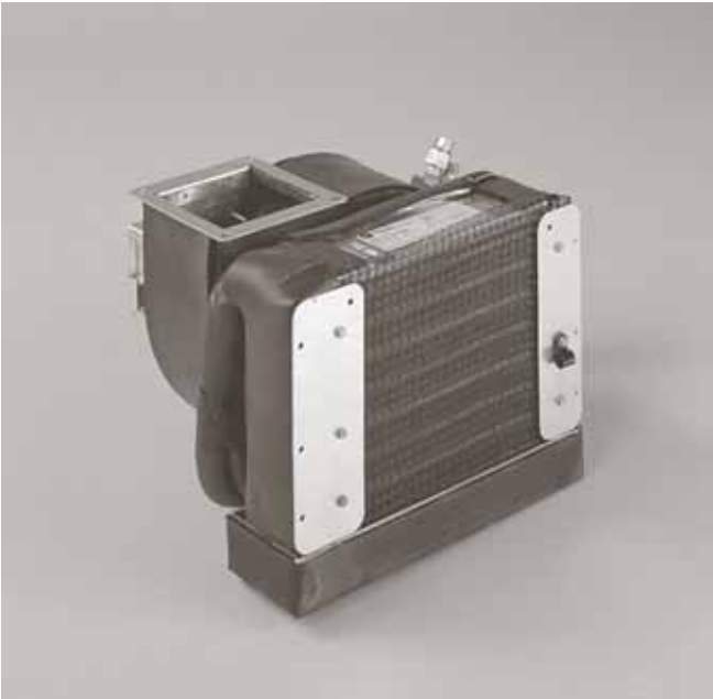
EBU7 Unit Shown