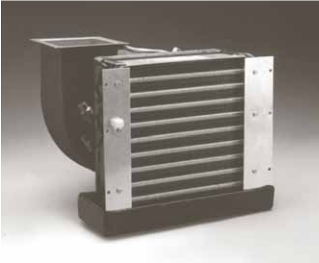
EBO16 Cooling Unit Shown