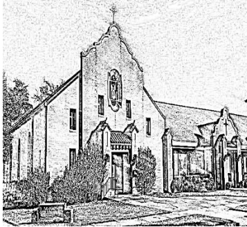
St. Joseph Church, Blackwell Office Hours-MWF 10am-12pm (580)-363-0441 stjosephblackwelloc@gmail.com

Acts 2:42-47; 1 Peter 1:3-9; Jn 20:19-31